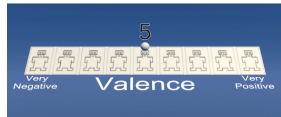
b: SAM Slider