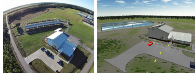
Figure 1: Bird's-eye view of the real (left) and virtual (right) facility.

© 2016 IEEE. Personal use of this material is permitted. Permission from IEEE must be obtained for all other uses, in any current or future media, including reprinting/republishing this material for advertising or promotional purposes, creating new collective works, for resale or redistribution to servers or lists, or reuse of any copyrighted component of this work in other works. 10.1109/VR.2016.7504701